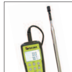
DC580C1 w/ hot-wire probe