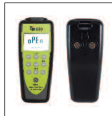
DC580 front and back