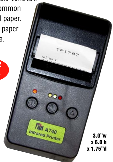
3.0" w x 6.0 h x 1.75" d