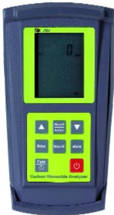
4.0" w X 8.12" h x 2.25" d

Test flue gasses at home or office spaces for the presence and location of CO leaks. With a protective rubber boot, the new 707 fits comfortably in your hand and operates with the push of a button.